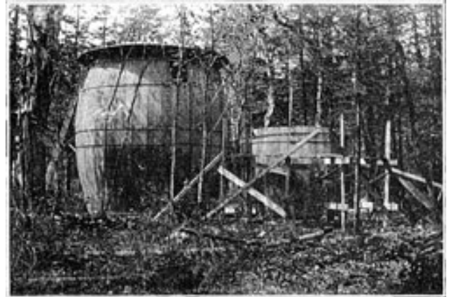
"Then they began cutting windows and doors—and things commenced to happen."