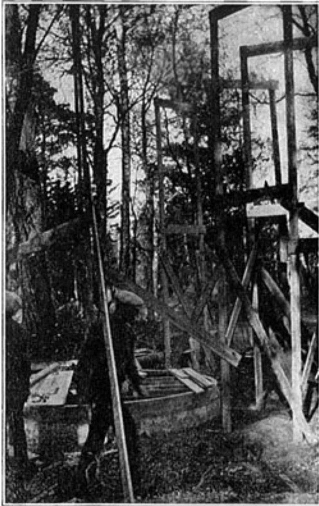
"They came motoring up to Grand Sable Lake with expert workmen from the cooperage shop."

The gigantic barrels are nicely finished on the outside in oil and look exactly like the regular half-barrel and the half-gallon pony keg we construct for Monarch Teenie Weenie Pickles transformed into a home.