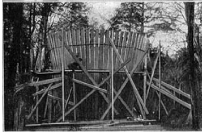
"The barrels were set up first on their foundations. Then they began to draw them in

On the back of the main barrel there is built a pantry and another barrel for the kitchen. This barrel is 8 feet in diameter at the bottom and top and 9 feet at the bilge, and has a liquid capacity of approximately 3,500