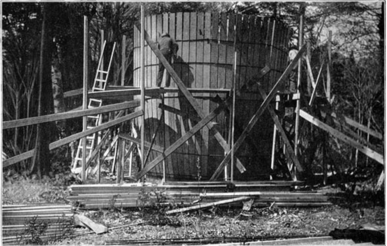
"New Problems of construction were presented at every step."